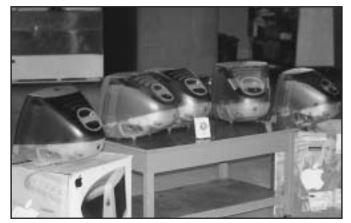
Five Flavors of iMac.